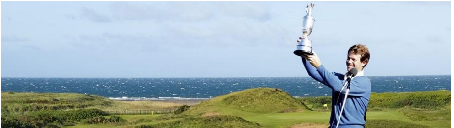
(Tom Watson - 1982 Open Champion, at Royal Troon)