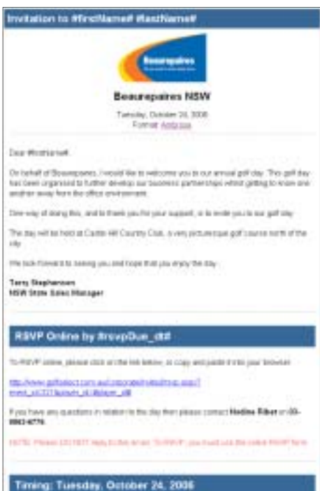
Invitation provides key information related to

Our RSVP administration system provides a complete control centre to help you administer the invitation process. The time saving here alone generally more than pays for the investment in this service.