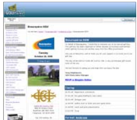
Invitation links through to web-page allowing guests to RSVP online.