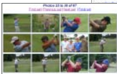
Photo gallery provides group and action shots of the day allowing people to click on these to blow up to larger images.

Results page is provided showing where each player finished. Additionally a personalized photo gallery is created for each player.